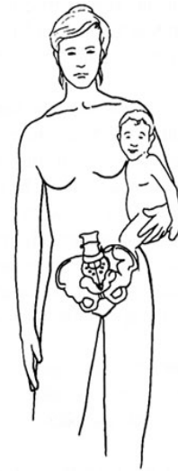
Mother Carrying Baby on the Hip

From the moment of conception, the body undergoes many chemical changes in the preparation for the nurturing and ultimate delivery of the baby. Unfortunately these hormonal changes often produce unpleasant symptoms in the mother and make the pregnancy long and difficult. Morning sickness is a common symptom in pregnancy and because the baby is developing, great care must be taken in the type and kind of treatment given to relieve nausea and other symptoms associated with pregnancy. Several recent studies suggest the safety and effectiveness of alternative remedies for morning sickness. The herbs ginger & raspberry are safe and effective. Acupuncture and acupressure on specific points on the wrist can also relieve the nausea of pregnancy.